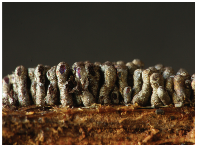
14 December 2012 Paradiachea caespitosa on old eucalypt log.