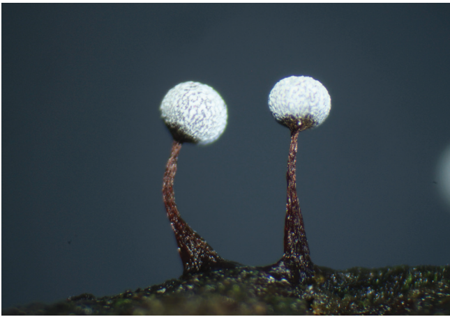
P. pusillum on dead Clematis aristata (24 May 2014)