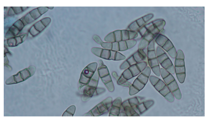
Organisms found on calyculus 1000x.